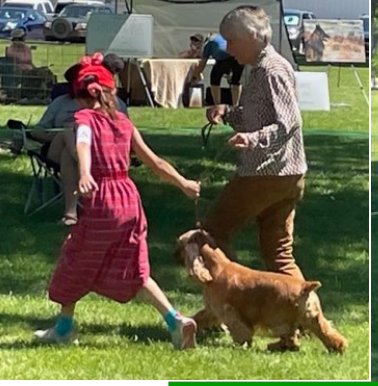
Our Pee Wees!