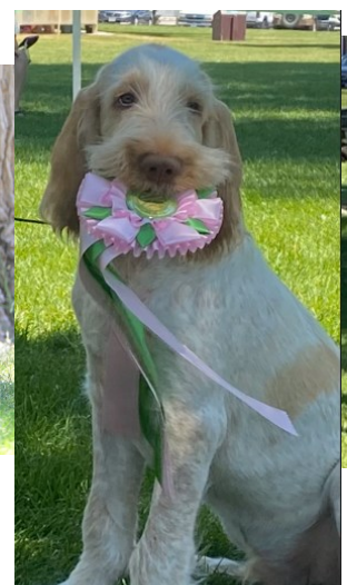
Best In Match ~ Puppy Spinone Italiano Giola's I Am The Storm owned by Elaine Bergenheir